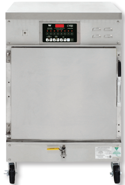
CAT509 CVAP® THERMALIZER OVEN HALF SIZE MODEL WITH FAN 8000 Series, 8 - Channel Electronic Control

CVap equipment complies with domestic and international requirements such as UL, C-UL, UL Sanitation, CE, MEA, and others.