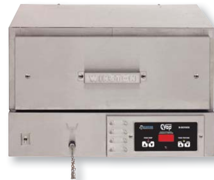
HBB0D1 CVAP® HOLD & SERVE DRAWER

CVap equipment complies with domestic and international requirements such as UL, C-UL, UL Sanitation, CE, MEA, and others.