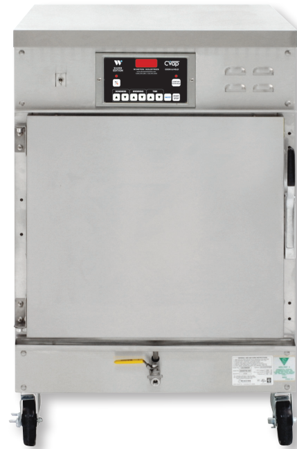
CAC509 CVAP® COOK & HOLD OVEN HALF SIZE MODEL WITH FAN 8000 Series Electronic Controls

CVap equipment complies with domestic and international requirements such as UL, C-UL, UL Sanitation, CE, MEA, and others.