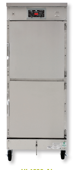
HL4522-AL CVAP® HOLDING CABINET FULL SIZE MODEL, WITH FAN Electronic Differential Control

CVap equipment complies with domestic and international requirements such as UL, C-UL, UL Sanitation, CE, MEA, and others.