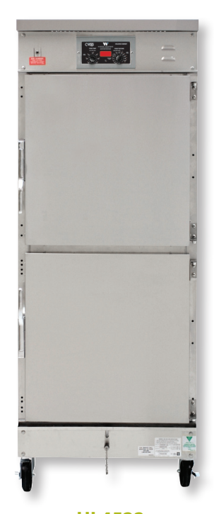
HL4522 CVAP® HOLDING CABINET FULL SIZE MODEL, WITH FAN Electronic Differential Control

CVap equipment complies with domestic and international requirements such as UL, C-UL, UL Sanitation, CE, MEA, and others.